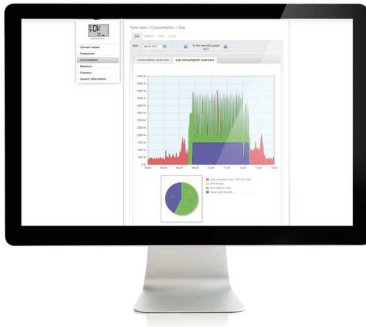
Graph of the daily consumption from the connected appliances.

The Solar-Log™ menu structure provides an intuitive user interface. This new structure allows smart electrical appliances, such as an AC ELWA-E in combination with Smart Plugs, to be controlled and prioritized based on the amount of surplus power. Different energy profiles and components can be linked and checked based on the simulation.