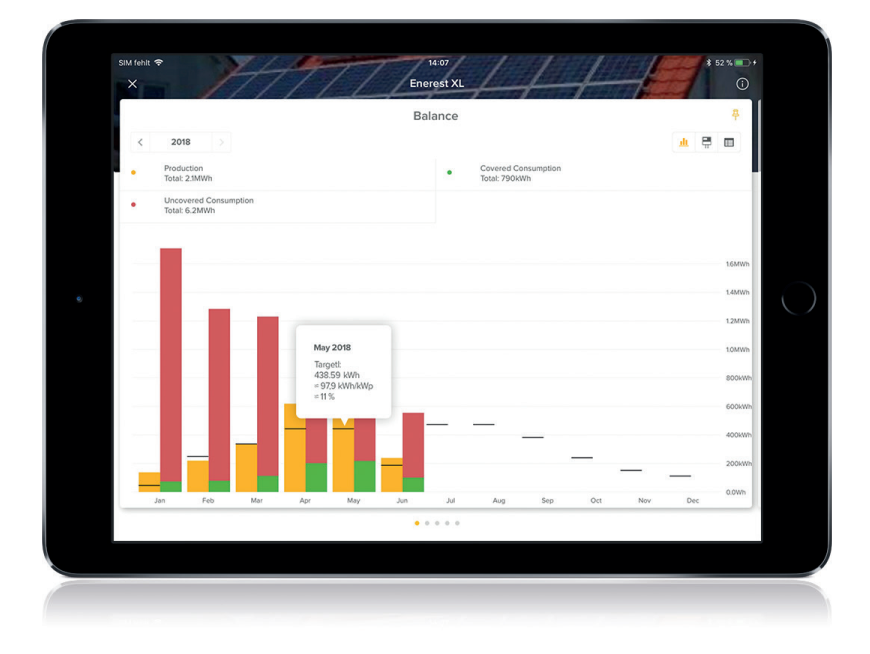
The balance chart is displayed as a bar graph with the target curve.