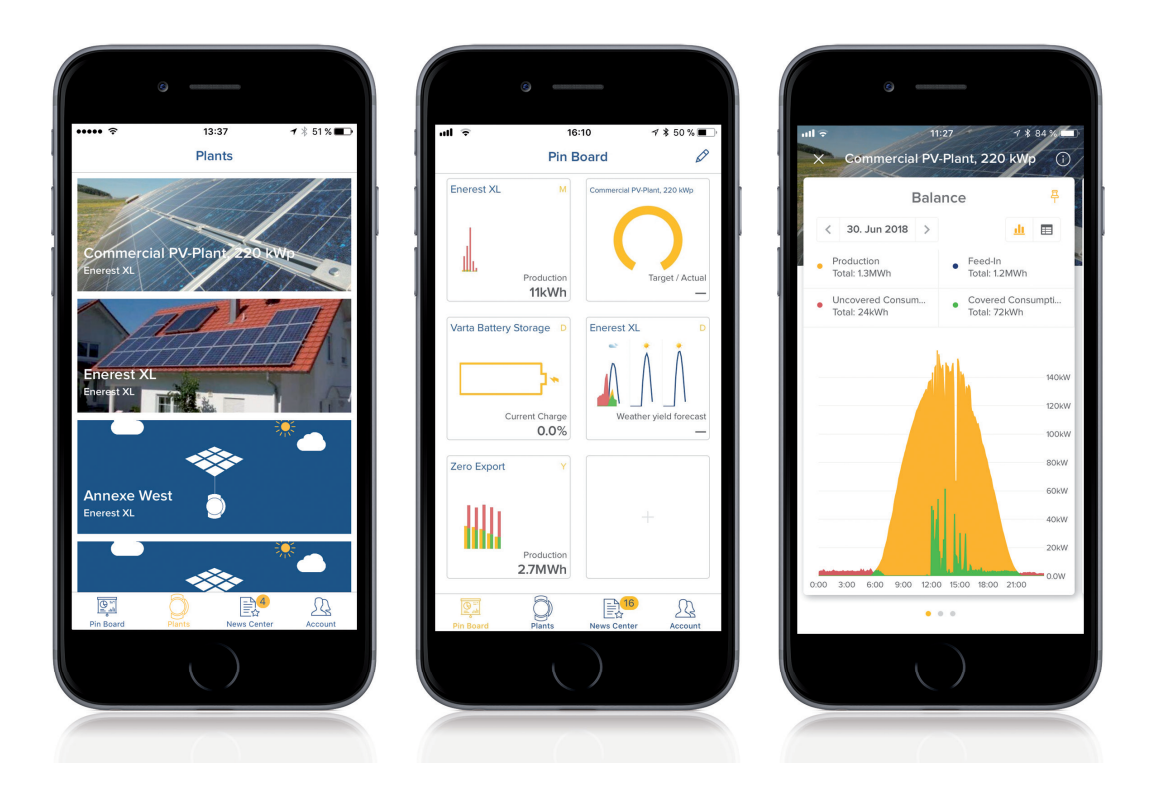
Illustration on the left: Plant Management - Illustration in the middle: Pin Board - Illustration on the right: Balance - Day View